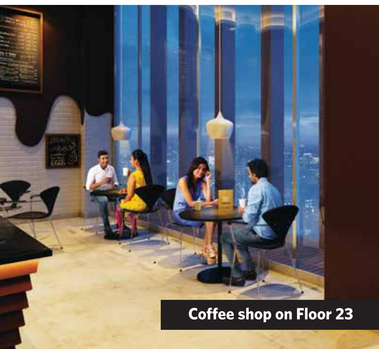
Coffee shop on Floor 23