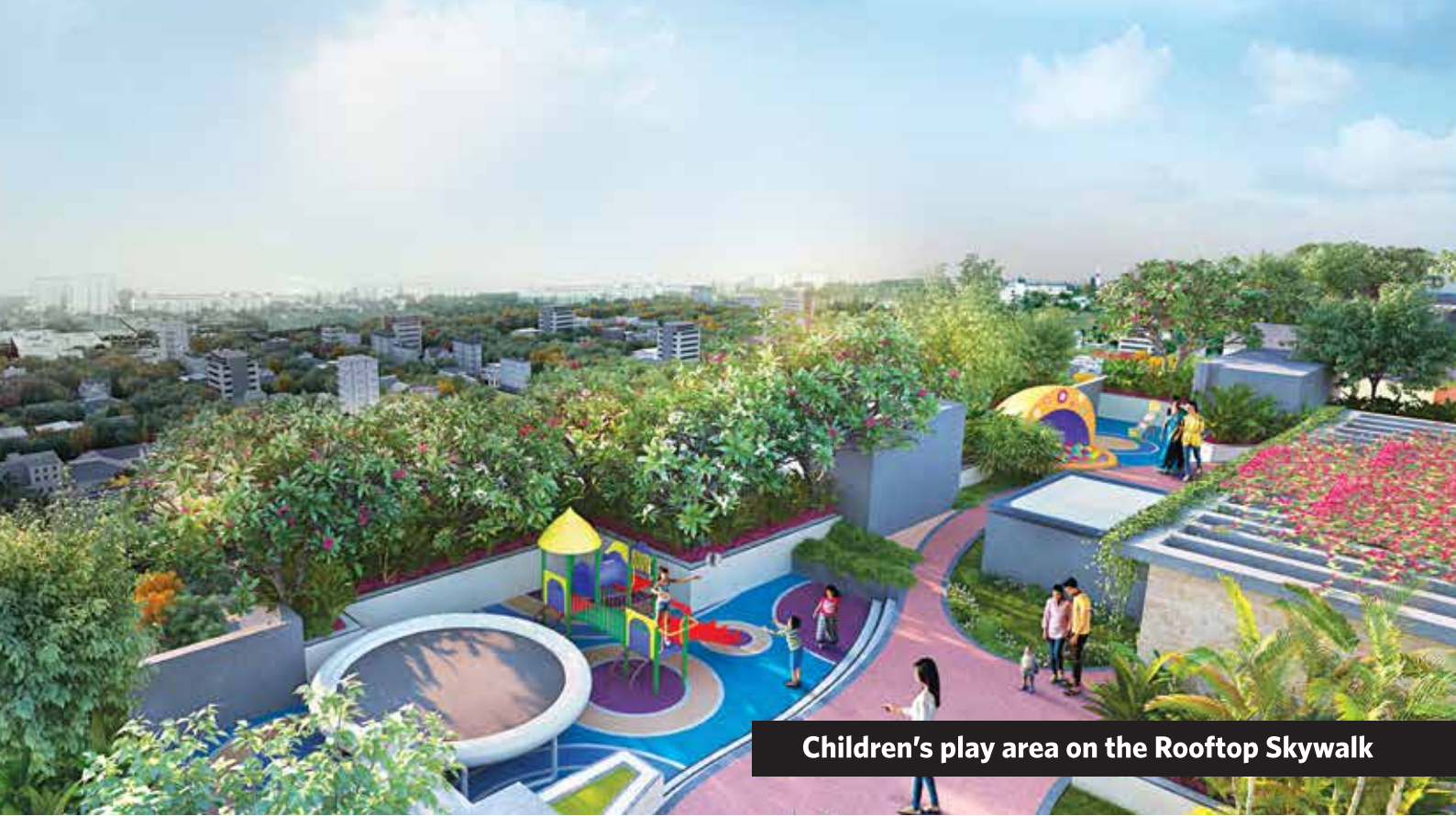
Children's play area on the Rooftop Skywalk