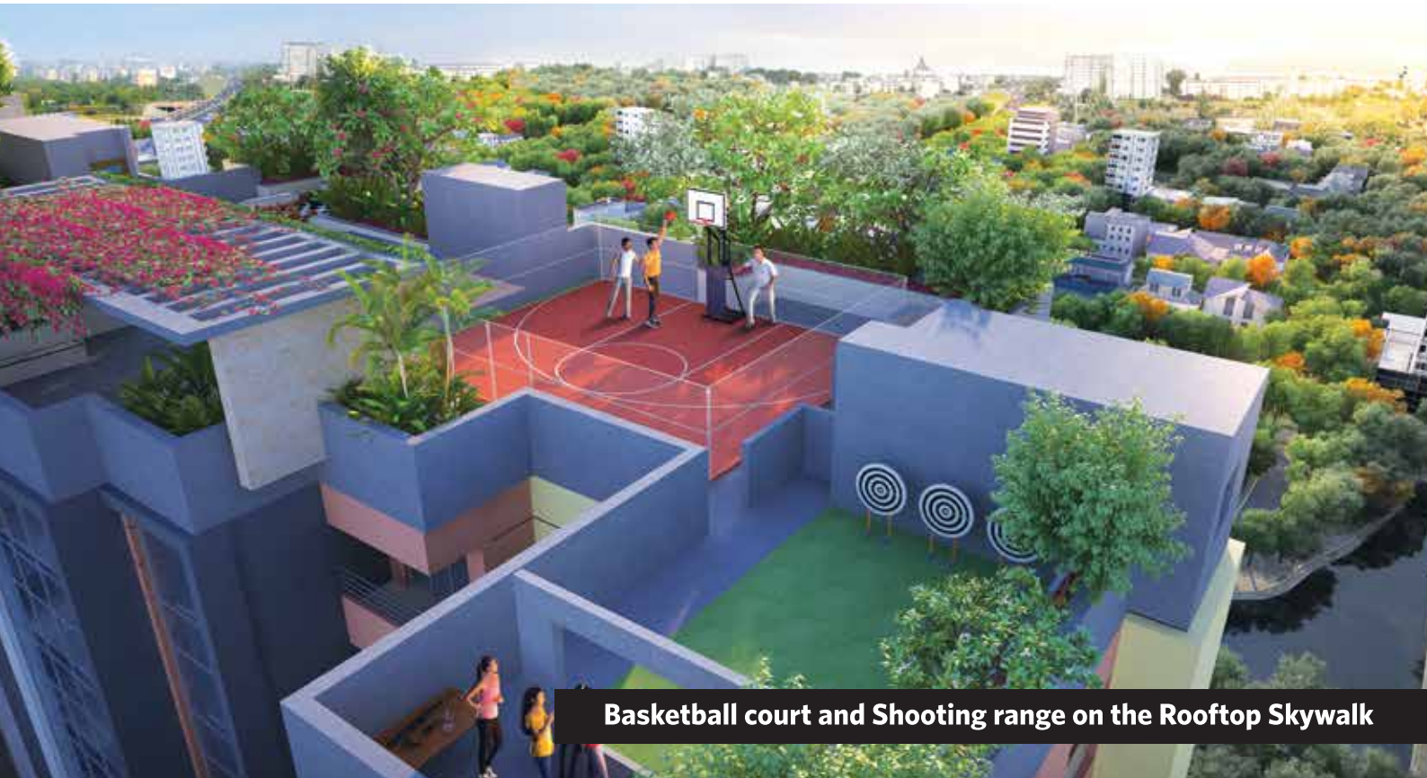
Basketball court and Shooting range on the Rooftop Skywalk

Up above the world so high Your life awaits in the sky