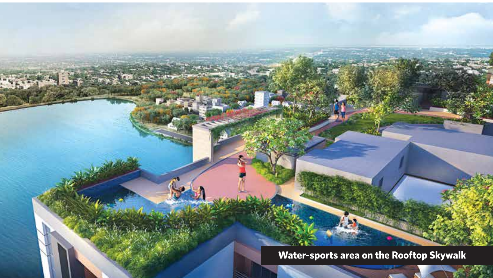
Water-sports area on the Rooftop Skywalk

adds a touch of natural serenity. A pristine promenade by the tranquil waters.