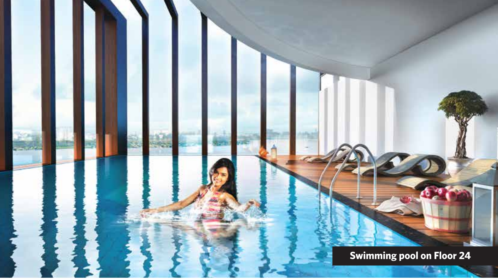
Swimming pool on Floor 24