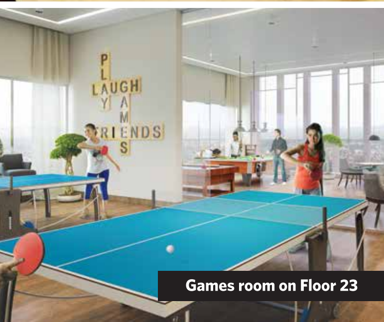
Games room on Floor 23