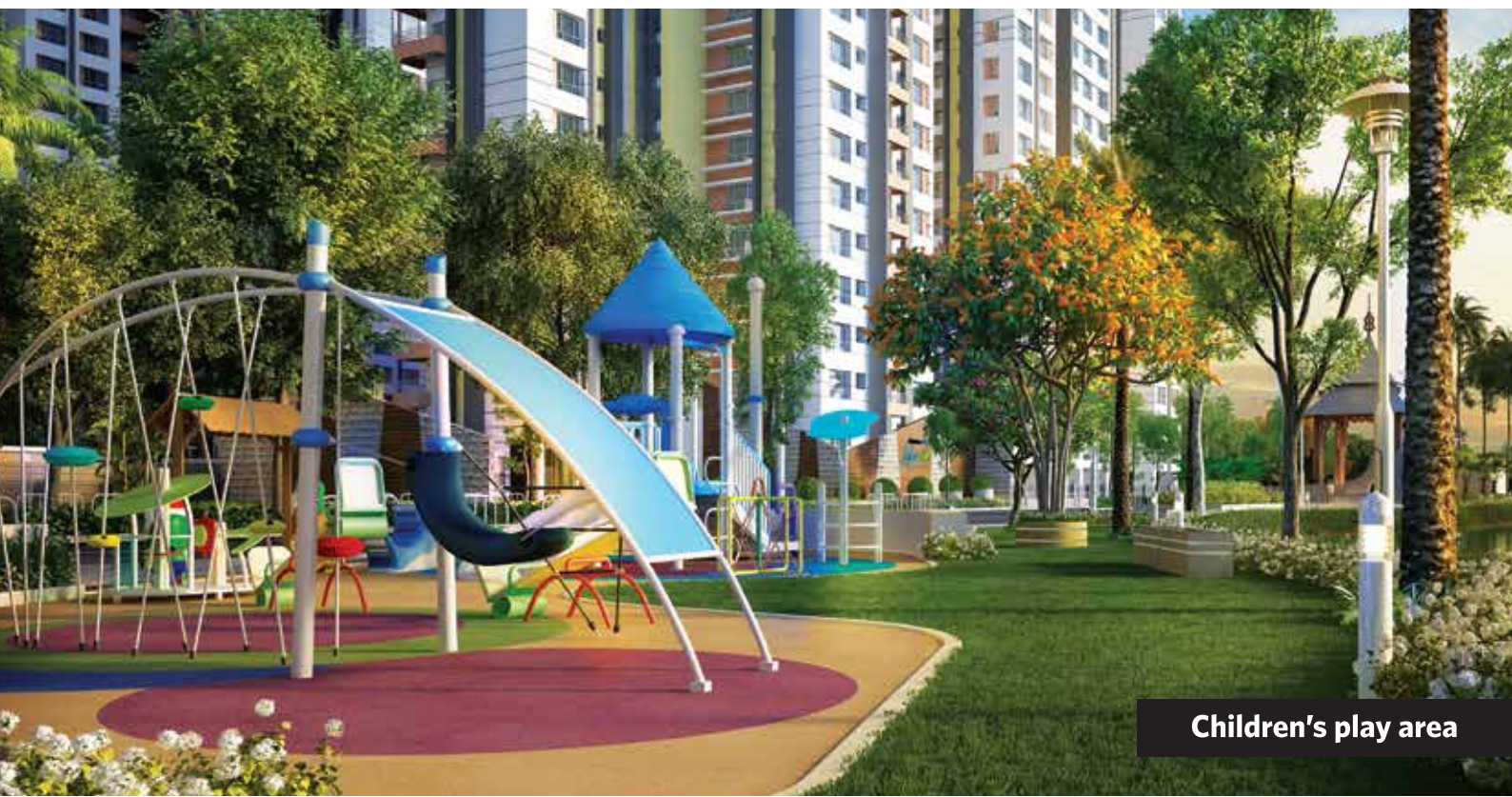
Children's play area