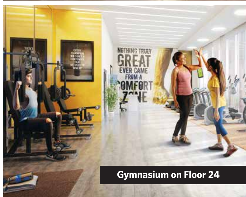
Gymnasium on Floor 24