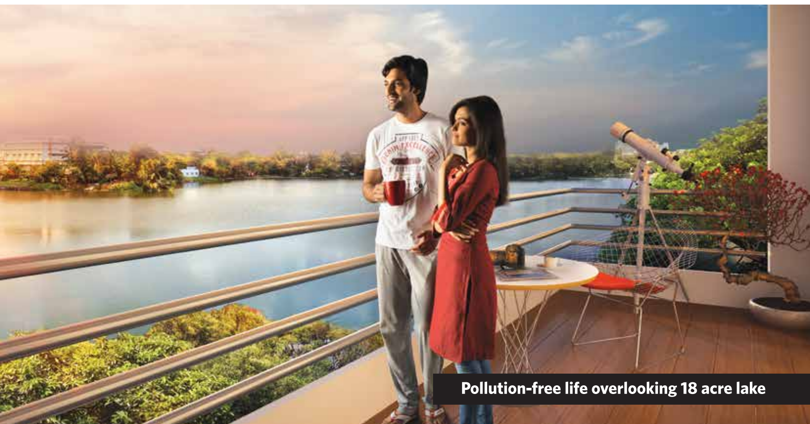
Pollution-free life overlooking 18 acre lake