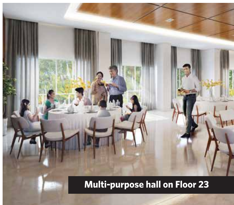
Multi-purpose hall on Floor 23