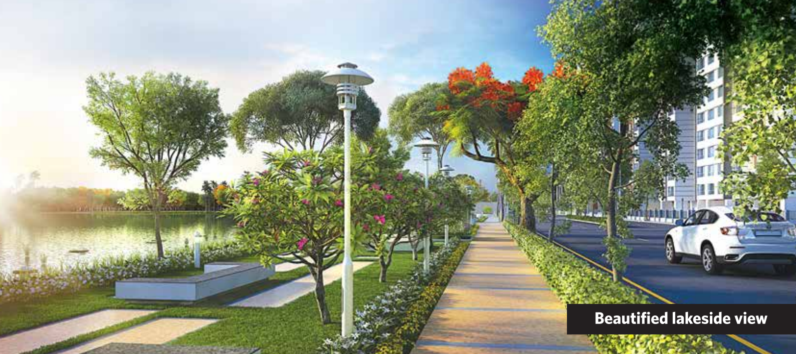
Beautified lakeside view